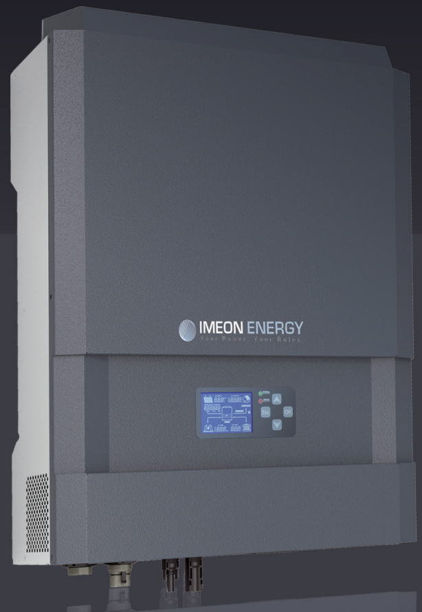
New IMEON 3.6 3kW PV input, 6kW AC output (2)

IMEON is a concentration of innovation and technology. Multi-sources phase coupling (Phase Coupling Energy, or PCE) is used to couple several energy sources (eg: PV / batteries / grid). There is no more need for source switching which often leads to micro-cuts. PCE solves the age long renewable energy concerns such as intermittence and fluctuation. IMEON's PCE has now made it possible to guarantee constant feed and optimal yields.